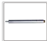
extension rod (included)